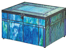
Seaside Glass Memory Chest