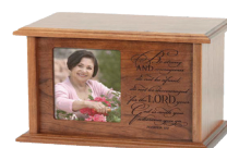
Expression Photo 4x6 Urn