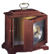
Corbett Mantle Clock