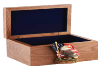
Walnut Memory Box